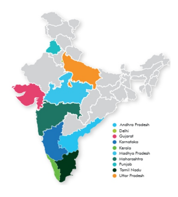
TOP 10 STATES WITH HIGHEST EMPLOYABILITY